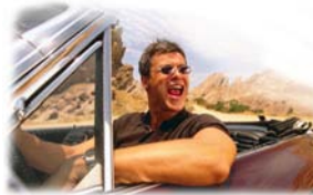
Sponsored by Local Outreach Commission

menfellowship@fbcredlands.org for information.